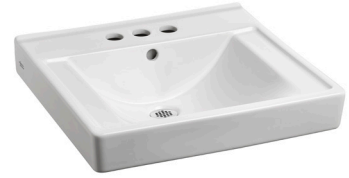
Model 9024.004EC 4" Centers