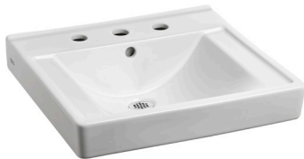
Model 9024.008EC 8" Centers