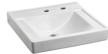
Model 9024.911EC CHO With Right Hand Soap Dispenser Less Overflow