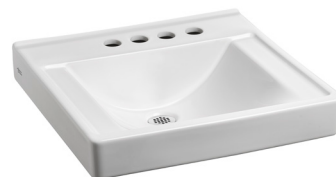
Model 9024.914EC 4" Centers With Right Hand Soap Dispenser Less Overflow