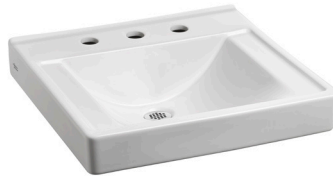
Model 9024.908EC 8" Centers Less Overflow