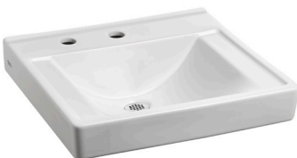
Model 9024.921EC CHO With Left Hand Soap Dispenser Less Overflow