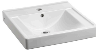
Model 9024.001EC Center Hole Only (CHO)