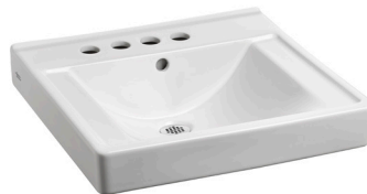
Model 9024.024EC 4" Centers With Left Hand Soap Dispenser