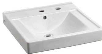
Model 9024.011EC CHO With Right Hand Soap Dispenser