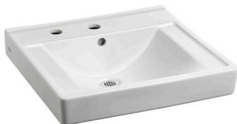
Model 9024.021EC CHO With Left Hand Soap Dispenser