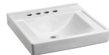
Model 9024.924EC 4" Centers With Left Hand Soap Dispenser Less Overflow