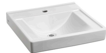
Model 9024.901EC CHO Less Overflow