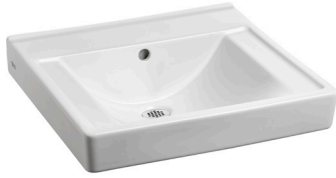
Model 9024.000EC No Faucet Holes