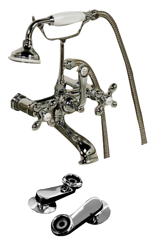
Adjustable Swivel Mounts