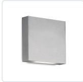
AT6606-BN-UNV Brushed Nickel