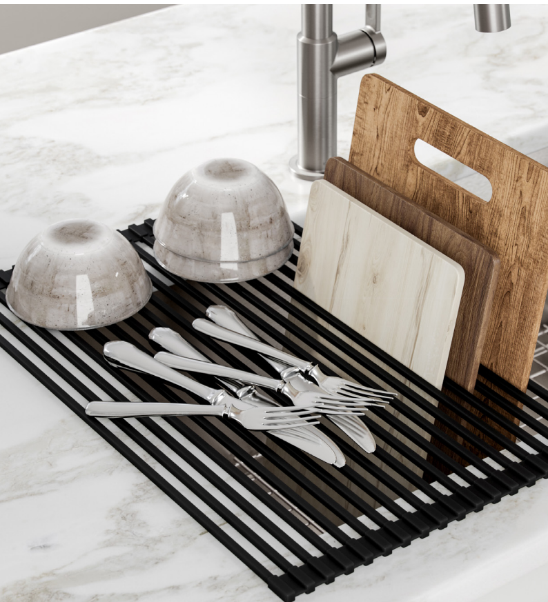
Multipurpose Over-Sink Roll-Up Dish Drying Rack (KRM-10)