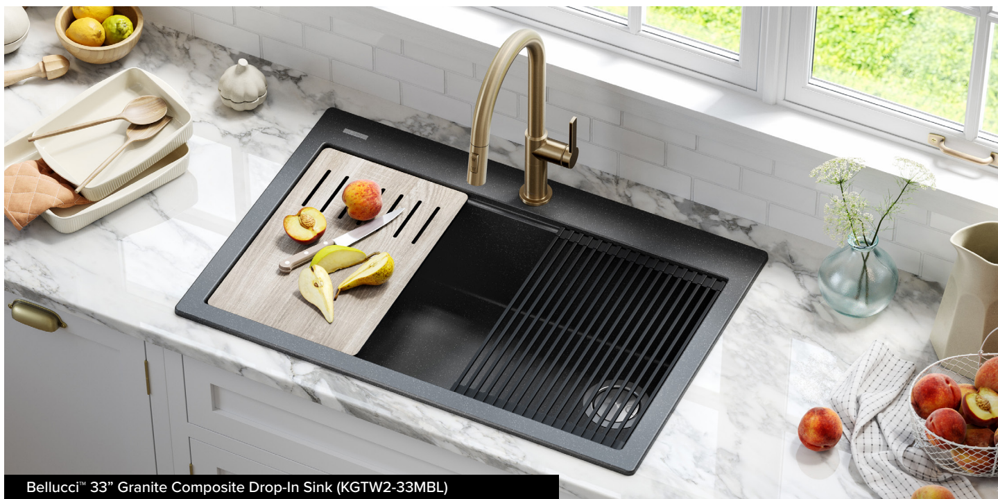
Bellucci™ 33" Granite Composite Drop-In Sink (KGTW2-33MBL)