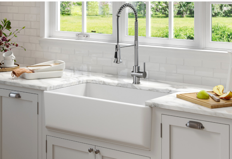
Turino™ 33" Fireclay Farmhouse Kitchen Sink (KFR1-33MWH)