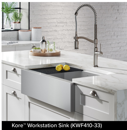
Kore™ Workstation Sink (KWF410-33)