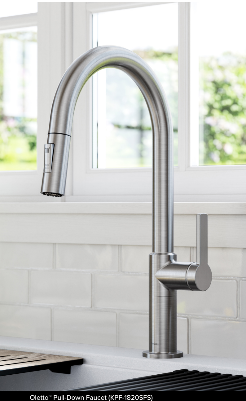
Oletto™ Pull-Down Faucet (KPF-1820SFS)

Keep your faucet looking newer longer with Spot-Free all-Brite™, a finish that requires less cleaning and shines longer by resisting water spots, fading, and fingerprints. For general maintenance of all-Brite™ faucets, we recommend cleaning your faucet with mild soap, rinsing thoroughly with warm water, and drying with a clean, soft cloth.