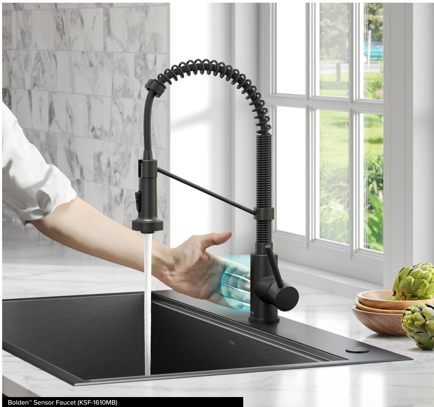
Bolden™ Sensor Faucet (KSF-1610MB)

Kraus Sensor Faucets are designed with hands-free capabilities, so they stay cleaner longer, with fewer spots and finger smudges over time. To clean and maintain your sensor faucet, simply follow the care instructions for Kraus Kitchen Faucets (Spot-Free Finishes or All Other Finishes), and enjoy the added benefit of ultra-clean hands-free functionality.