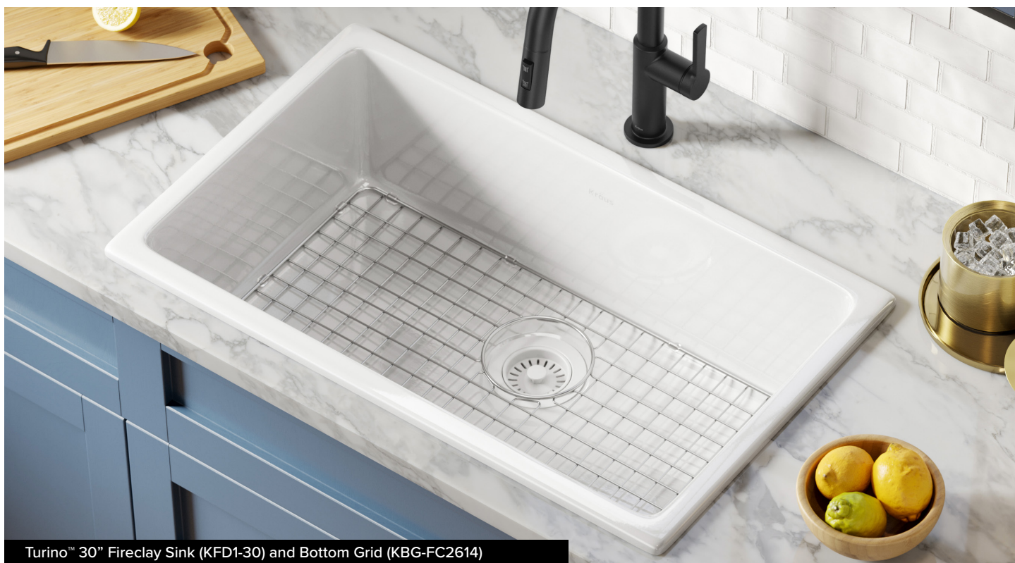
Turino™ 30" Fireclay Sink (KFD1-30) and Bottom Grid (KBG-FC2614)