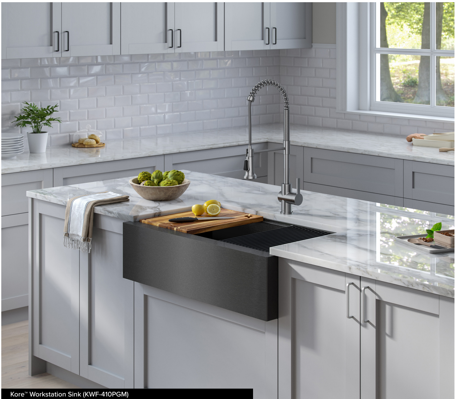
Kore™ Workstation Sink (KWF-410PGM)

Kraus PVD sinks are a showpiece in any kitchen, with a modern yet timeless appearance that is incredibly easy to maintain. Proprietary DuraShield™ finish application results in a color coating that bonds completely to the sink, resulting in unparalleled durability with superior resistance to abrasion, chips, and corrosion. The sandblasted matte texture resists water spots and fingerprints, so the sink stays cleaner longer. Maintenance is as simple as wiping down the sink surface with a microfiber cloth after use.