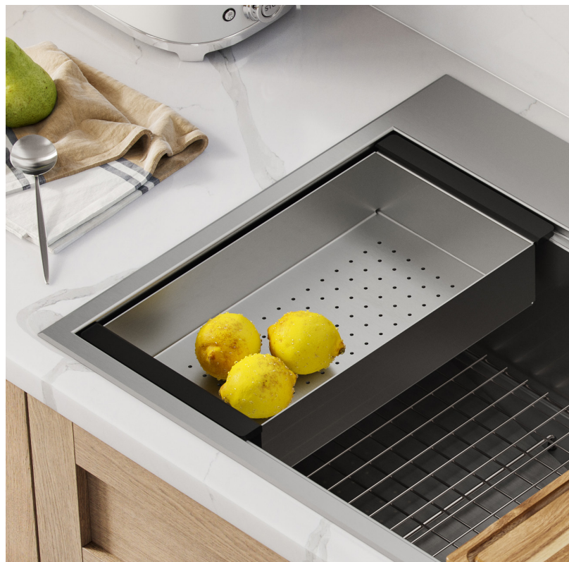
Stainless Steel Colander for Workstation Sink (CS-6)