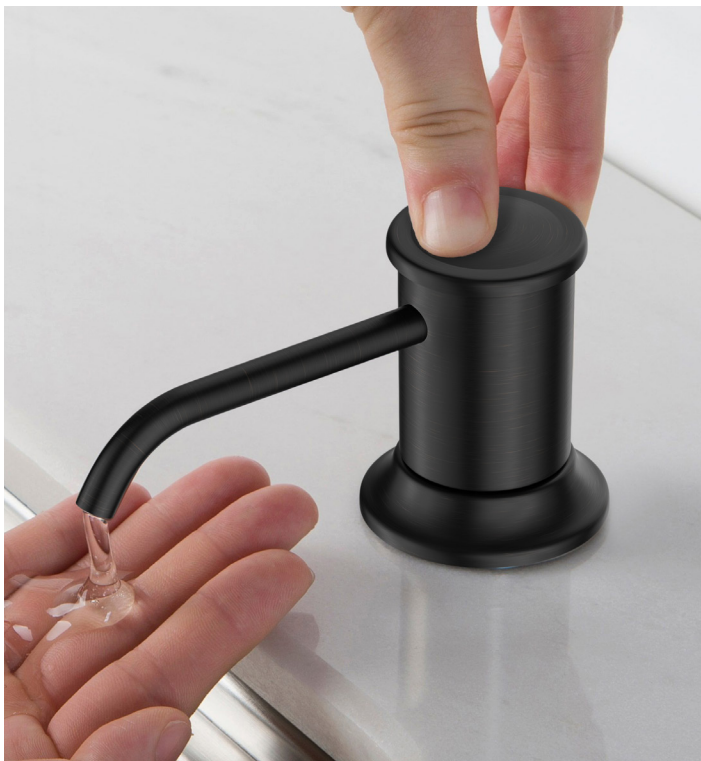
Kitchen Soap and Lotion Dispenser (KSD-80ORB)