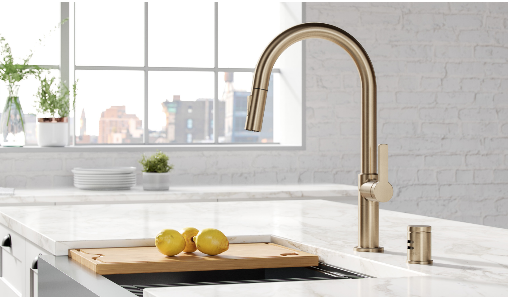
Oletto™ Pull Down Faucet (KPF-2820SFACB) and Air Gap (KAG-1SFACB)