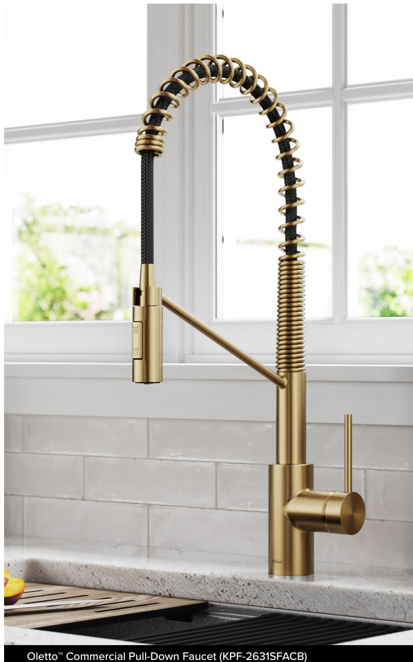
Oletto™ Commercial Pull-Down Faucet (KPF-2631SFACB)