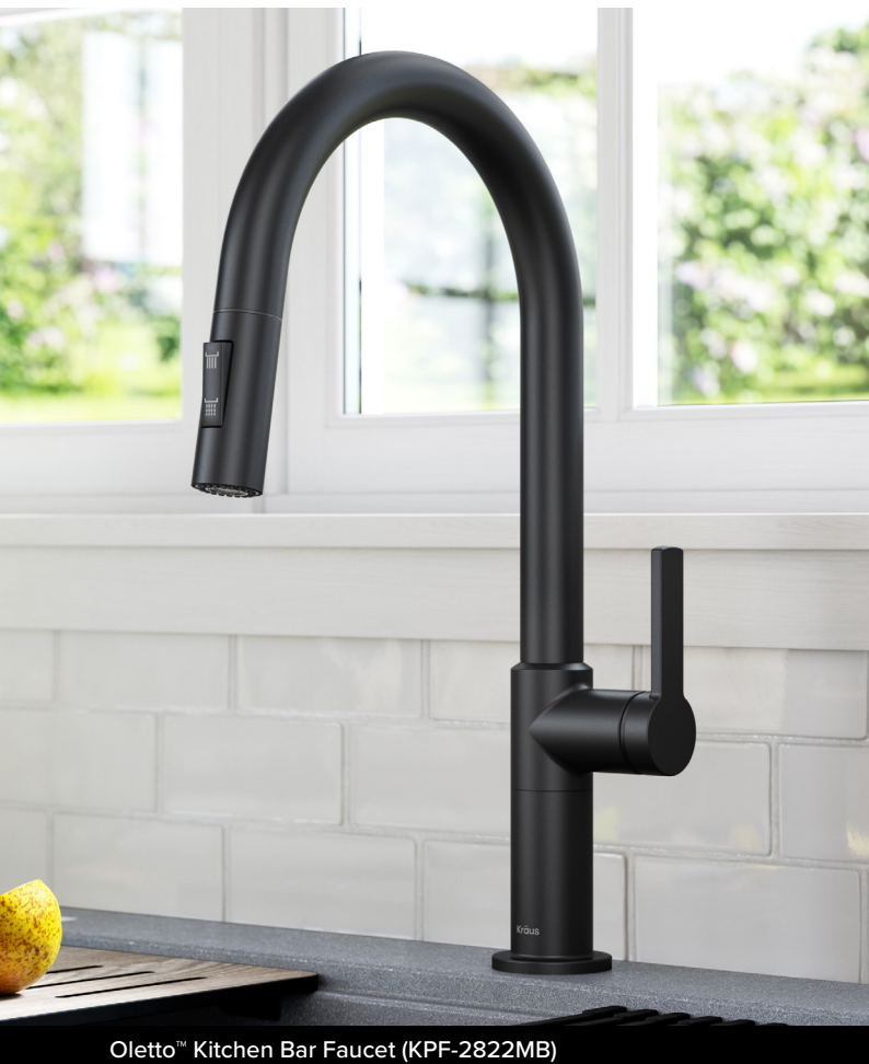
Oletto™ Kitchen Bar Faucet (KPF-2822MB)