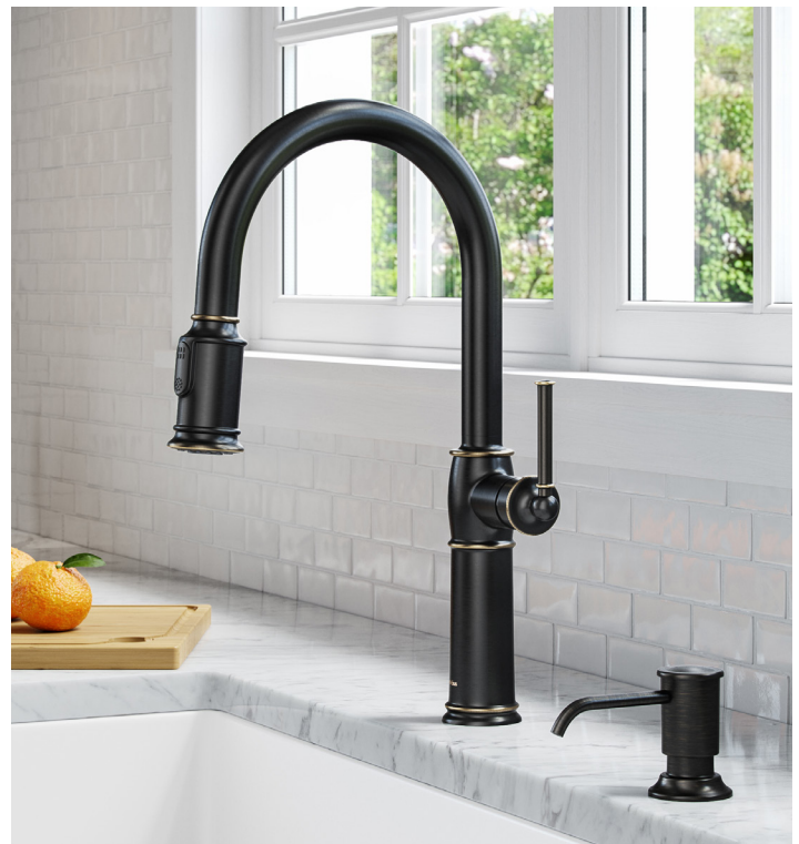
Kitchen Soap and Lotion Dispenser (KSD-80ORB)