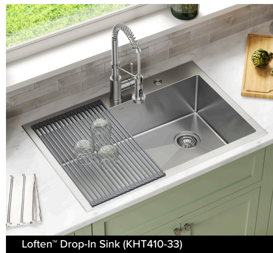
Loften™ Drop-In Sink (KHT410-33)