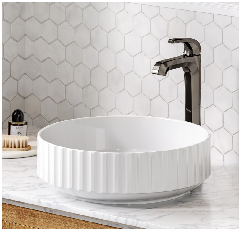
Viva™ Porcelain Ceramic Vessel Bathroom Sink (KCV-201GWH)