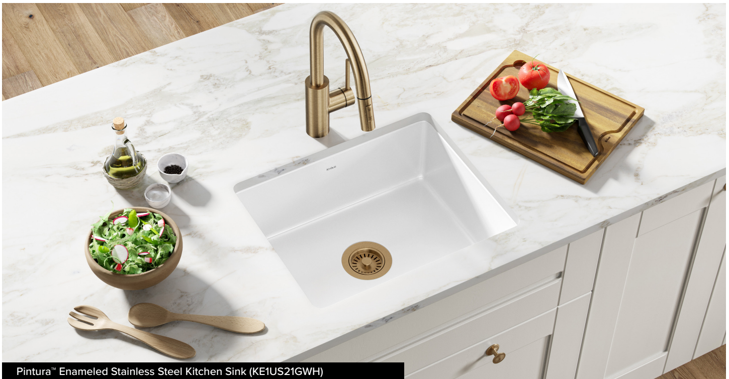
Pintura™ Enameled Stainless Steel Kitchen Sink (KE1US21GWH)