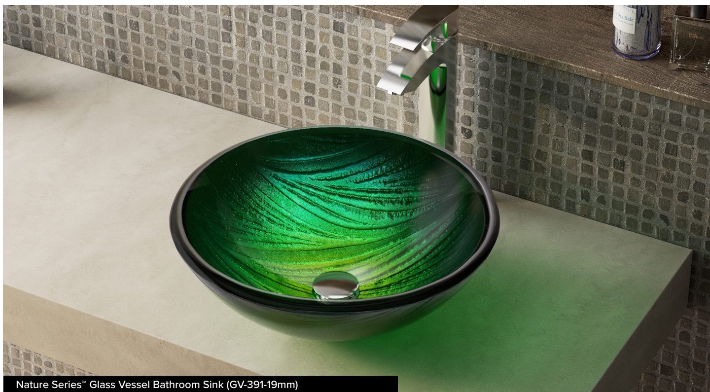
Nature Series™ Glass Vessel Bathroom Sink (GV-391-19mm)