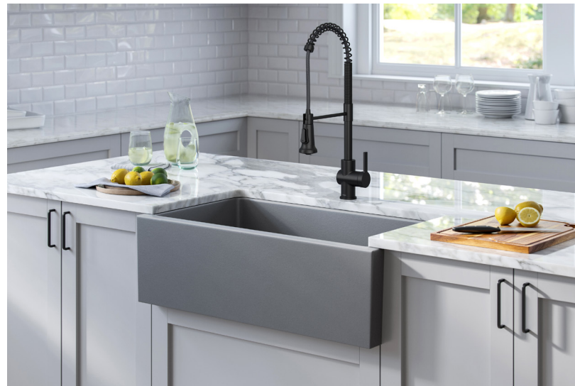
Turino™ 33" Fireclay Farmhouse Kitchen Sink (KFR1-33MGR)