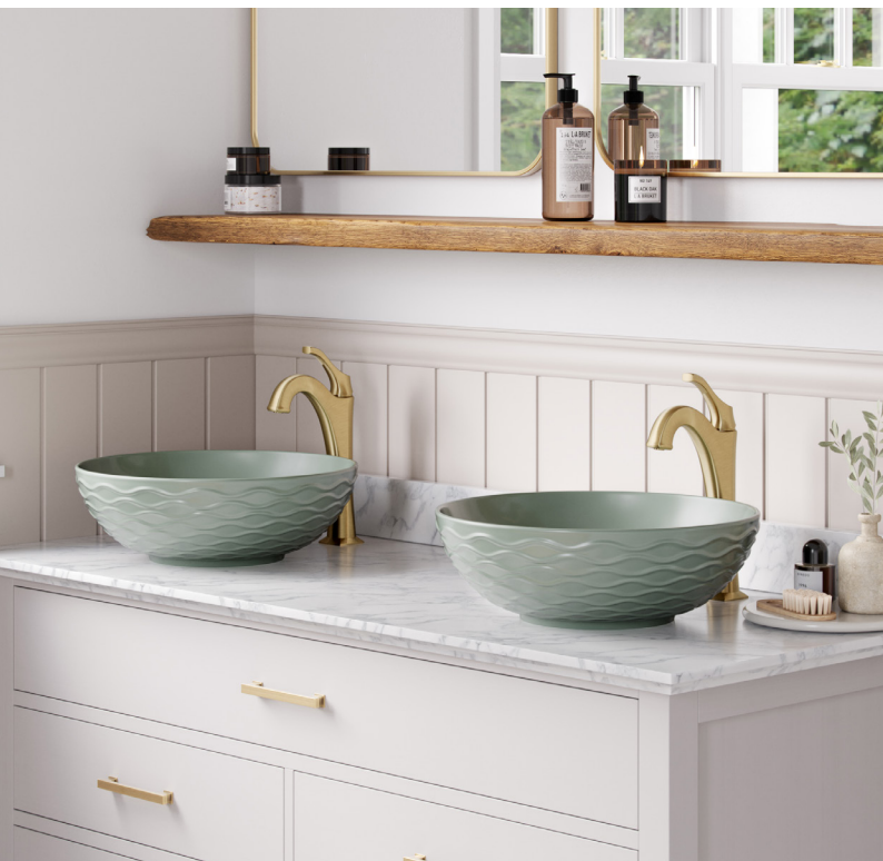
Viva™ Porcelain Ceramic Vessel Bathroom Sink (KCV-200GGR)