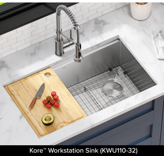
Kore™ Workstation Sink (KWU110-32)