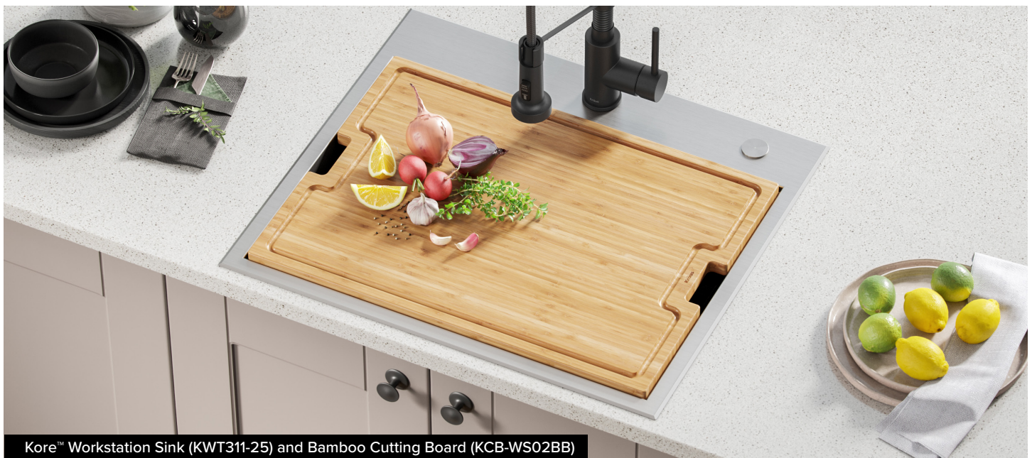
Kore™ Workstation Sink (KWT311-25) and Bamboo Cutting Board (KCB-WS02BB)