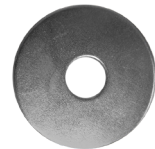
(12) 1 1/4" washers