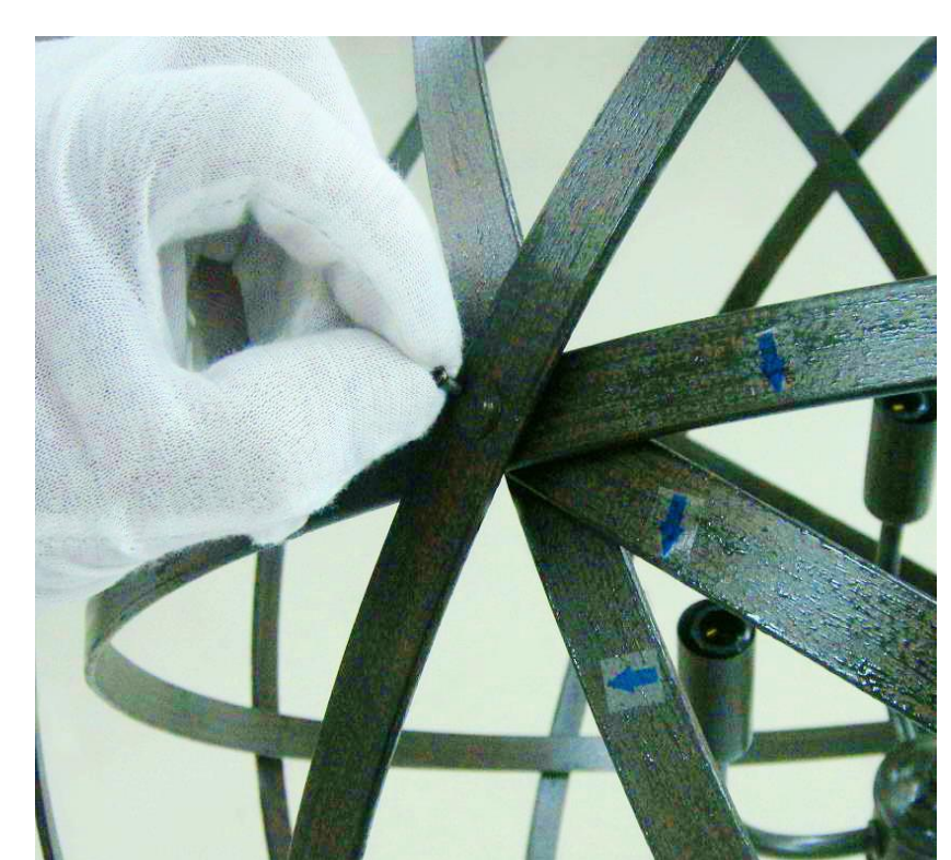
Orb Assembly Step-2