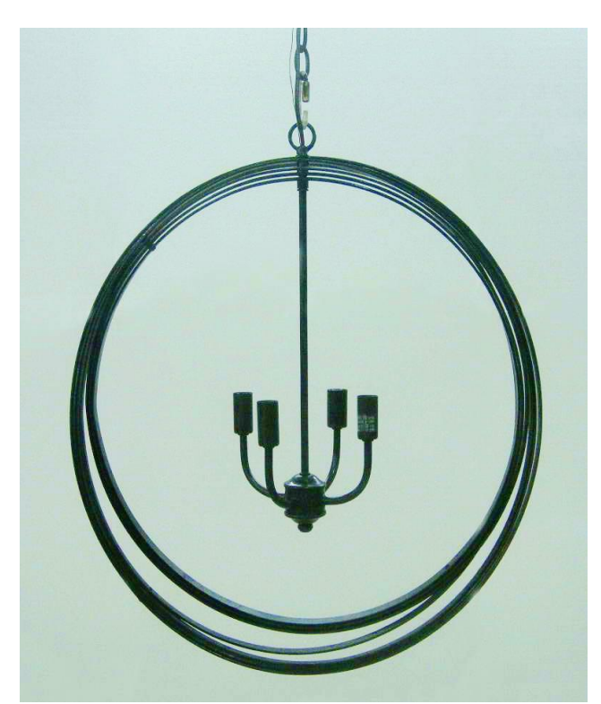
Orb Assembly Step-1