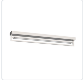
SF16240-BN Brushed Nickel

Mondrian series is composed from numerous rectilinear frames of light. The illuminated borders surrounding an open central void create an illusion of levitation. The airy design and negative space allow the fixture to visually blend into the environment. High-quality finish and simple forms coalesce in the elegant new product.