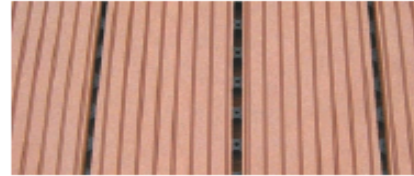
Tiles have a grooved, anti-slip surface