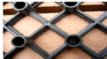
Stainless steel screws secure the tile to the base