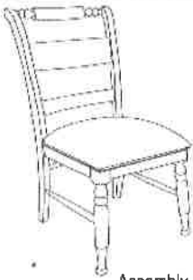
Assembly Completed !!..

Thank You for purchasing this quality product. Be sure to check all packing material carefully for small parts which may have come loose inside the carton during shipment. Identify and count all parts and compare with the parts List Below .