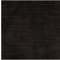
with Contrast Welt 2770- 91CC