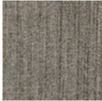
Body Fabric: 2767-93CC