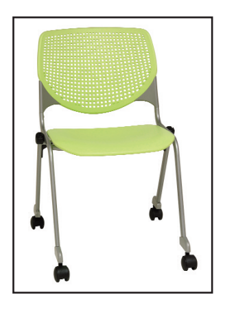
Available with: Silver Arms Black Writing Tablet w/ Black Arm Black Document Basket