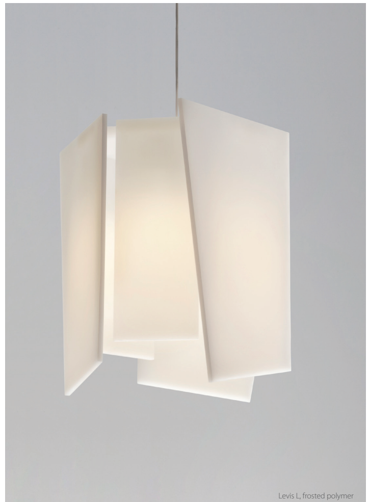
Levis L, frosted polymer