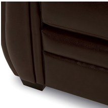
ESPRESSO WOOD LEG