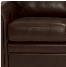
ATTACHED SEAT CUSHIONS