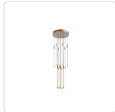
MP75121-BG Brushed Gold