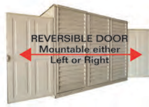
REVERSIBLE DOOR Mountable either Left or Right