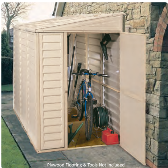
Plywood Flooring & Tools Not Included