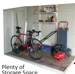
Plenty of Storage Space