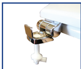
Corrosion proof, self aligning hardware