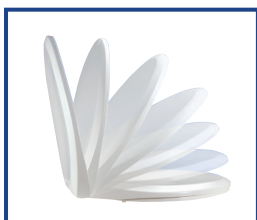
Slow Close Seat