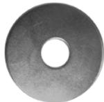
(20) 1 1/4" washers