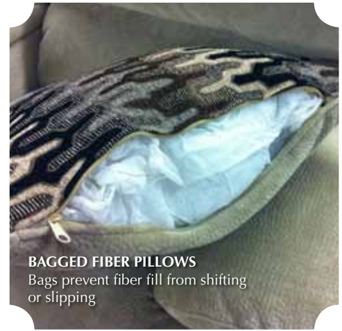
BAGGED FIBER PILLOWS Bags prevent fiber fill from shifting or slipping