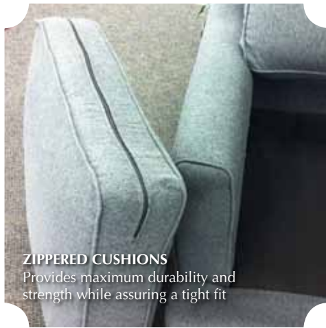
ZIPPERED CUSHIONS Provides maximum durability and strength while assuring a tight fit