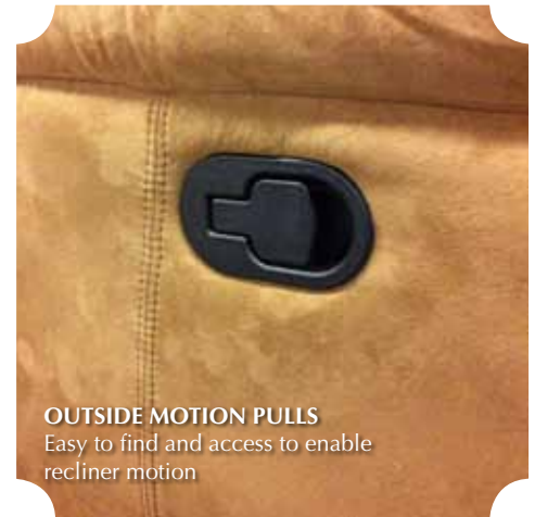
OUTSIDE MOTION PULLS Easy to find and access to enable recliner motion