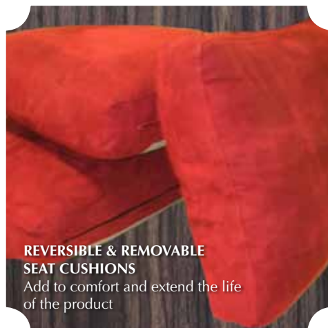
REVERSIBLE & REMOVABLE SEAT CUSHIONS Add to comfort and extend the life of the product