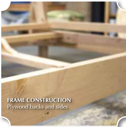
FRAME CONSTRUCTION Plywood backs and sides