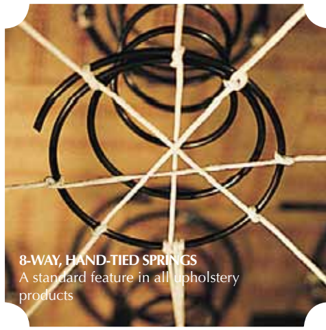
8-WAY, HAND-TIED SPRINGS A standard feature in all upholstery products