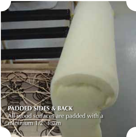
PADDED SIDES & BACK All wood surfaces are padded with a minimum 1/2" foam