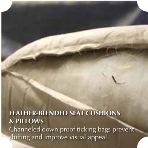
FEATHER-BLENDED SEAT CUSHIONS & PILLOWS Channeled down proof ticking bags prevent shifting and improve visual appeal