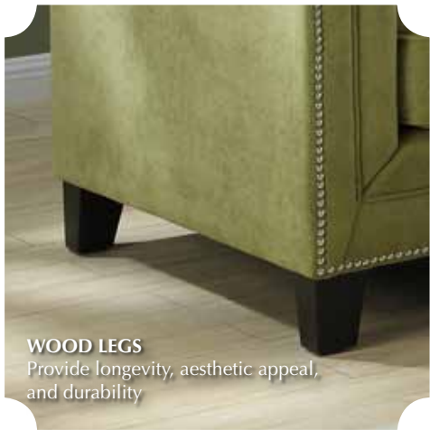
WOOD LEGS Provide longevity, aesthetic appeal, and durability