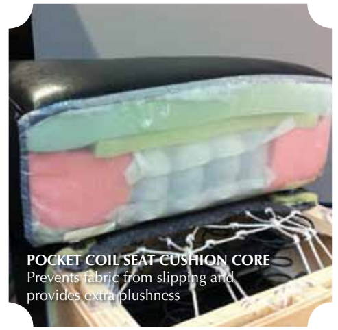
POCKET COIL SEAT CUSHION CORE Prevents fabric from slipping and provides extra plushness