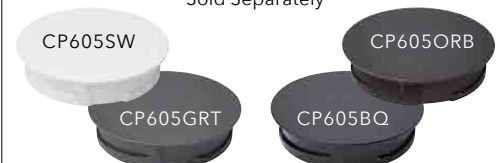
OPTIONAL No-Light Plates