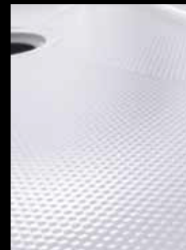
Slip Resistant Base