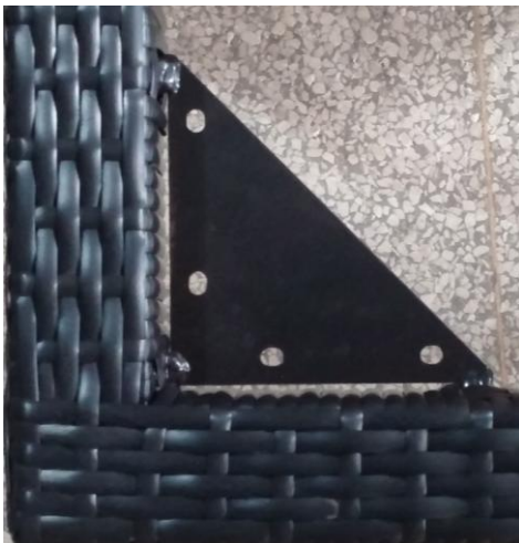
Top side of frame