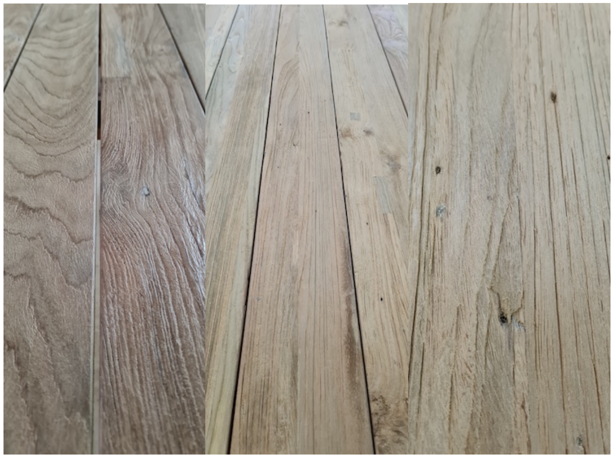
GRAIN & COLOR VARIATION NAIL HOLES

Sometimes some oxidation will occur around the areas where there were once nails in the wood. These may cause dark spots. Again, these are a feature of recycled teak products.