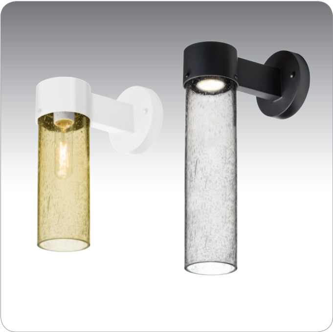
SHOWN IN GOLD BUBBLE & CLEAR BUBBLE WITH LED OPTION