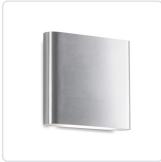
AT68006-BN Brushed Nickel