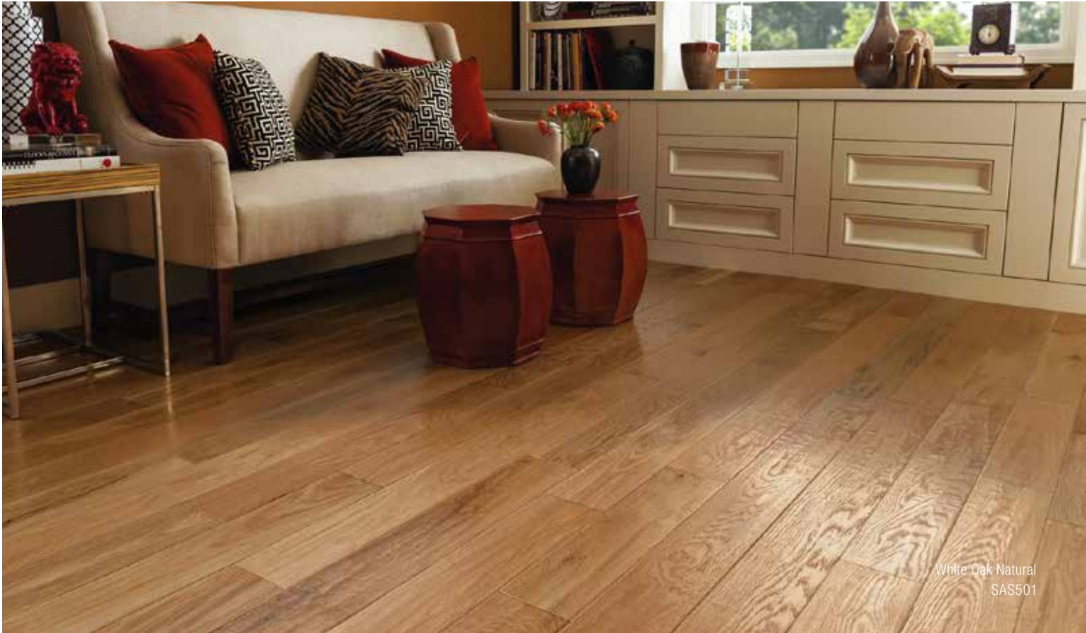
White Oak Natural SAS501

American Scrape® hardwood floors feature more than 90% domestic content.