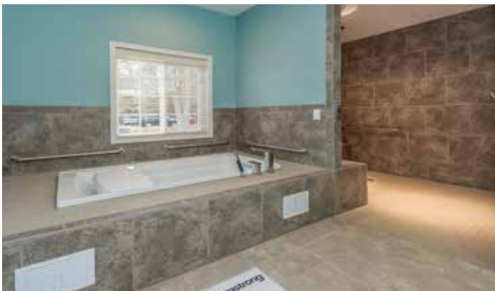
Armstrong Alterna™ installed on the bathroom floors