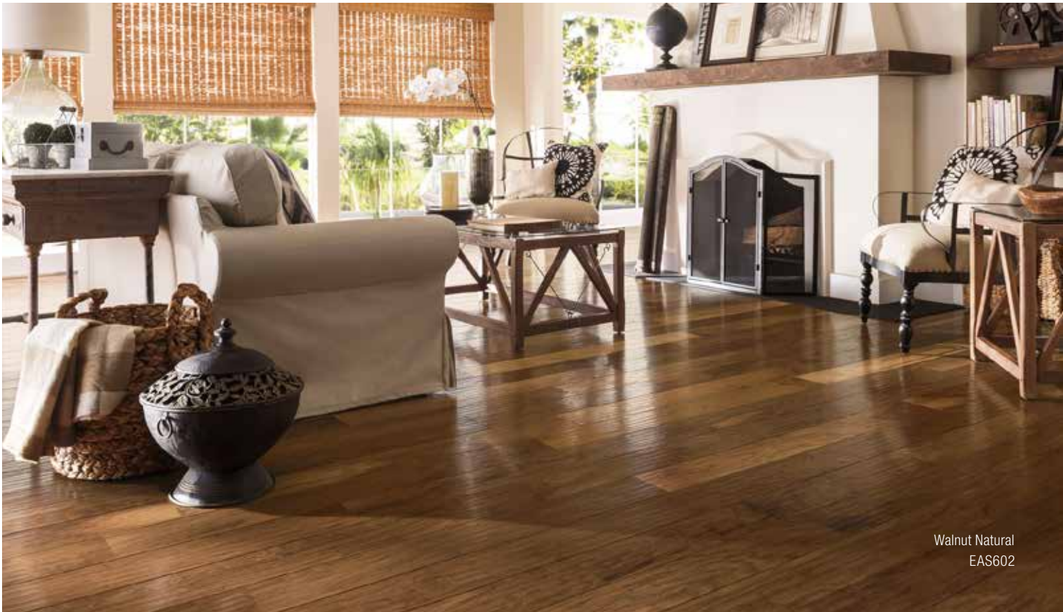
Walnut Natural EAS602