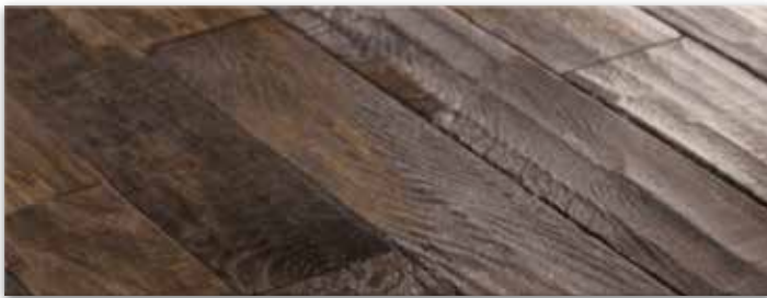
Hickory / Oak - highly textured rustic