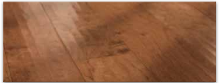
Maple / Cherry / Walnut - subtly textured refined scrape