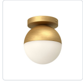
FM58306-BG/OP Brushed Gold/Opal Glass