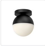
FM58306-BK/OP Black/Opal Glass