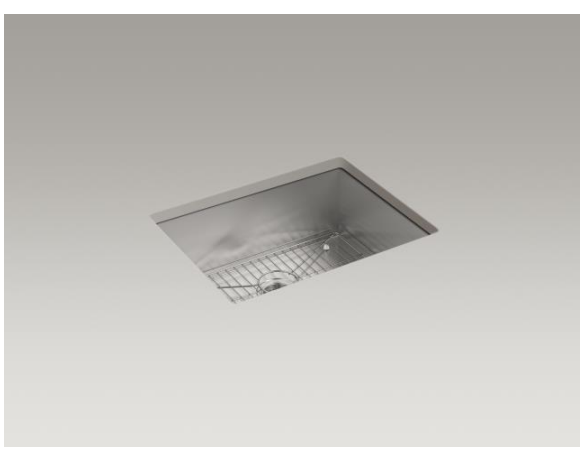
Codes/Standards ASME A112.19.3/CSA B45.4

Product includes: K-6645 1130570 Hardware Kit, Self-Rimming