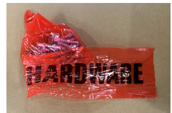
Example of red bag

Your hardware can be found taped under the furniture frame in a red bag or a small box with a red string.