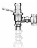
DOLPHIN TYPE 1 CLASS A

**Contact Your Local Sloan Representative