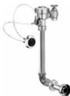
REGAL 940-1.6 XL