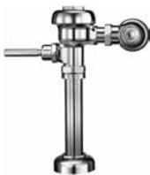
REGAL 110 XL