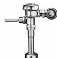
REGAL 180 XL

**Contact Your Local Sloan Representative