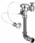
REGAL 9603 XL