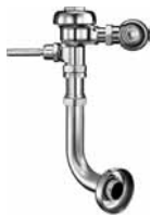
REGAL 120 XL